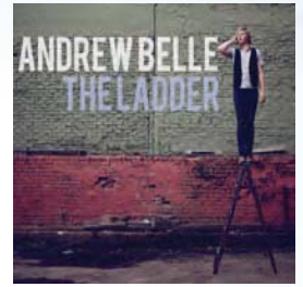
The Ladder Debut LP January 2010